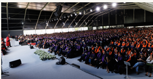
A large marquee was set up on the campus to accommodate more than 4,000 people.